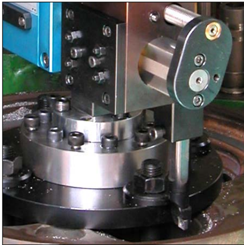
Refacing cylinder head