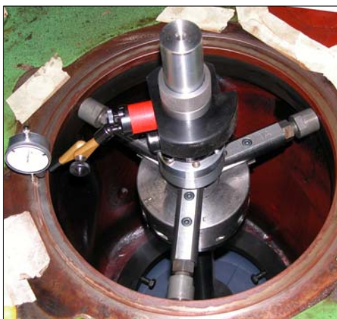
Mounting pilot in cylinder bore